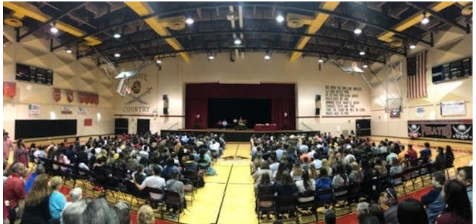
Get Involved and stay Involved * Full house at a parent assembly

6. Provide assistance, training, workshops, events and/or meetings for parents to help them understand the education system, curriculum, standards, state assessments and achievement levels.