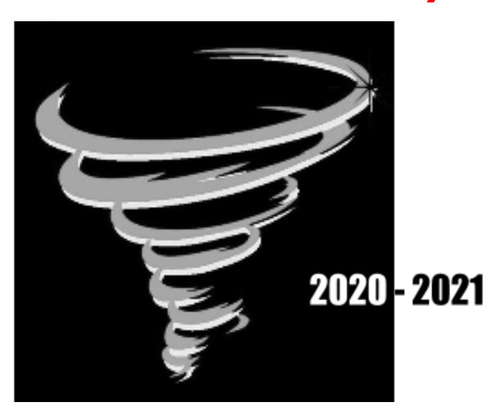
Family Engagement Plan

School Name: Brooker Elementary School #: 04-0161